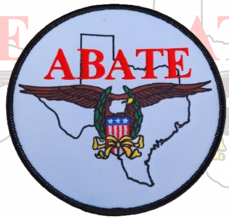
5" MEMBERS ONLY