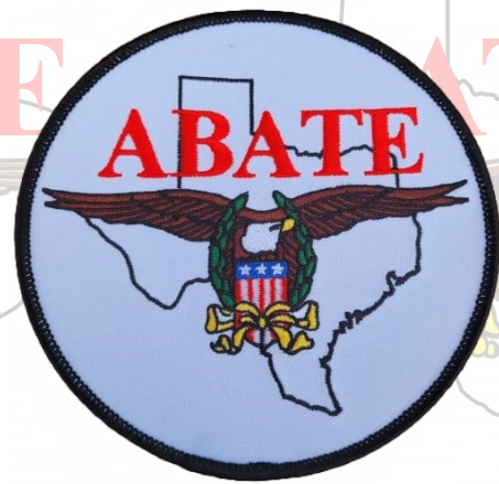
5" MEMBERS ONLY

These patches are available for ACTIVE TEXAS ABATE