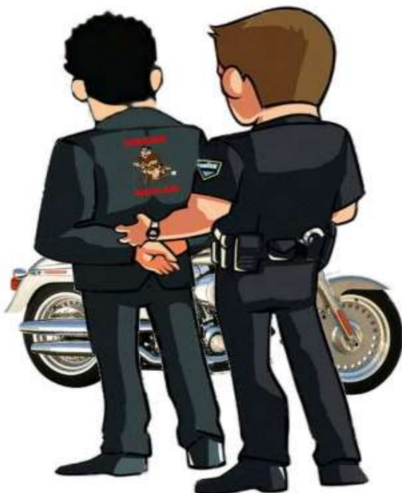
Arrested and put in jail for not using turn signals